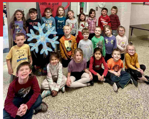
Kindergarten Winter Reading Challenge Award Winners